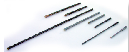
Heavy Duty Drill Bits